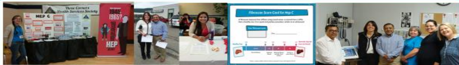
Adaptation from CanHepC Infographic (2016). Retrieved from: http://canhepc.ca/images/documents/CallforAction/CanHepC_Infographic_Letter_5-SCREEN.pdf

Implement proven strategies for reducing cost of Hepatitis C medications to allow for universal access